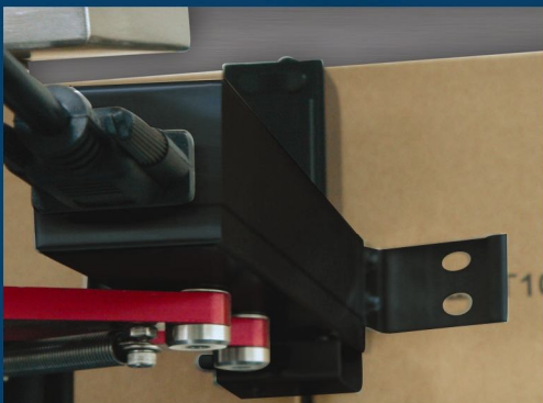
Spring mount to help maintain distance between print head and product to be perfectly printed.