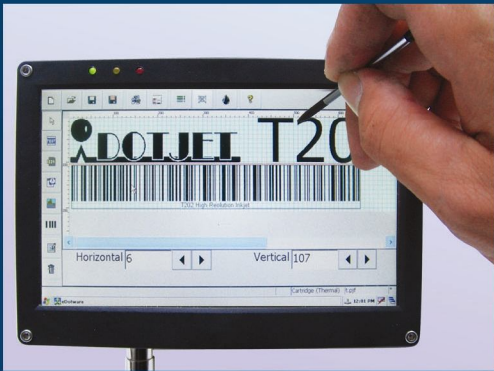
7" LCD Graphic display with touch screen.

A compact inkjet coder with the lowest running costs and easiest operation for coding on porous substrates.