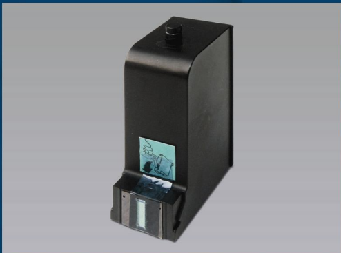
Unique inkjet cartridge of 42ml capacity available for 9mm printing height.